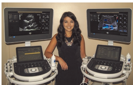
Two New Ultrasound Machines Improve Mercy College Student Experience

Phase 2 of the campus renovation will be complete in December 2017 and will provide faculty offices, as well as additional classroom, lab and simulation space to augment space currently available on the main campus. Once construction is complete, the College will occupy a brand new, 20,000 square foot, 2-story building plus 20,000 square feet of completely remodeled space on the garden level and first floor of 921 6 th Avenue.