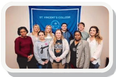
Inaugural Stamford Radiography Class—the Class of 2016

BRIDGEPORT, CT — St. Vincent's College held an Opening Day Celebration and Blessing at its newest location in Stamford on Tuesday, January 20. This site allows the College to expand its Radiography Program, which includes both theory and clinical experiences.